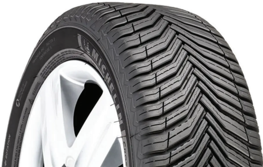
Michelin CrossClimate2

Michelin is at or near the top of most tire categories we test. Typically, its models offer a good mix of grip, handling, and long tread life. And even though Michelins are often among the most expensive tires, they tend to be a good value when factoring in performance and tread life. All nine tested models earn a CR recommendation. A standout is the Michelin CrossClimate2, an all-weather tire that provides winter traction without needing to be removed when snow season ends. It's in the all-season SUV category, but it's also suitable for cars. Other top-rated Michelin tires include the Defender2 all-season tire and the Pilot Sport All-Season 4 ultra-high-performance tire.