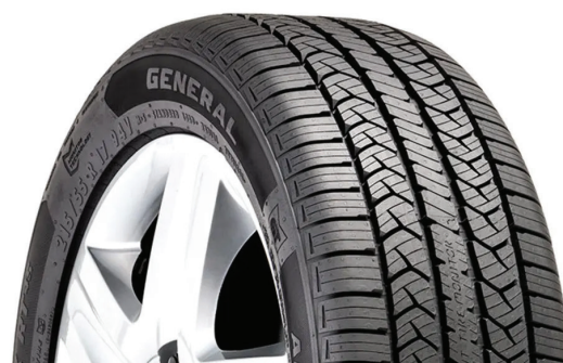
General Altimax RT45

Founded in 1915, General Tire is now a division of Continental AG. In our tests, the brand has become synonymous with value. General models are typically stronger performers that deliver good value. We recommend five of the six tested tires from General, with the exception of the G-Max AS-05, a UHP all-season tire. A couple of stars are the Altimax Grabber HTS60 all-season truck and G-Max RS UHP summer tires. Both tires are among the tops in their category.