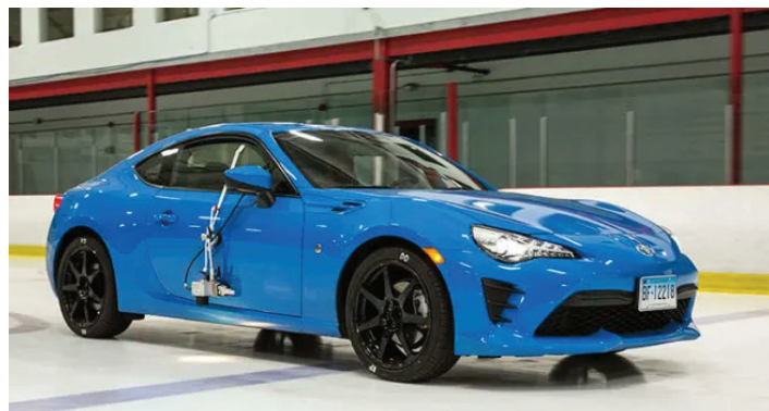
We do ice braking tests at a skating rink.

A tire must excel at performance and safety in our tests to earn a Consumer Reports recommendation, a distinction noted in our dynamic ratings chart.