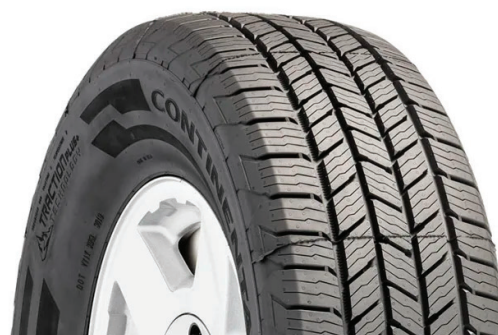
Continental TerrainContact H/T

Continental tires often rank among the best, but not always, underscoring the value of checking the ratings for specific models. All seven tested Continentals earned a CR recommendation. The brand is particularly strong in truck tires, with the TerrainContact H/T being our top all-season truck tire and the TerrainContact A/T being the highest-rated all-terrain truck tire.