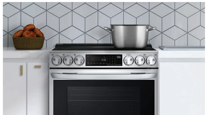
The best range brands produce models with high-performing cooktops, ovens that maintain their temperature, and great results in CR's member surveys.

Below, we cover models and brands in two categories: gas ranges and the combination of induction, smoothtop, and electric coil ranges. For each of those categories, we included only brands