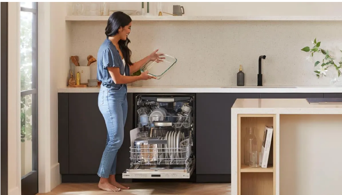
Unsure about which dishwasher to purchase? Knowing the best brands is a good way to start.

Shopping for a dishwasher can be overwhelming. Many of us want to narrow the field and simplify the search. Others want details on every option. In either case, it's natural to gravitate toward familiar brand names. But is a dishwasher's brand a good indicator of how well it will perform or how quiet and energy-efficient it will be?