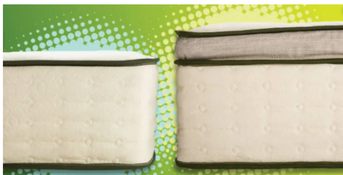
Avocado Green (left) and Avocado Green Pillowtop mattresses.

Pillowtop or no pillowtop? That's often the question when you're weighing a brand's basic mattress against its more premium version, which adds a cushier layer of material on top and might have implications for the type of sheets you buy to fit: A pillowtop tends to make the mattress several inches taller and several pounds heavier. It might also make the mattress softer.